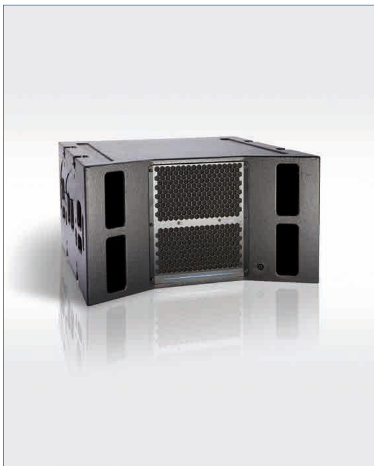
UNILINE UL115B low frequency speaker

The UL115B is the low frequency speaker dedicated to the UNILINE line array speaker. The rigging and transport systems have been optimized for very quick and secure set-up and transport. The 4 point rigging system has been designed to enable cardioid configuration where one speaker is turned around in the cluster. The mechanical system enables to adapt to all kinds of set-up: flying of simple clusters, clusters combining UL115B and UL120/D, simple or combined stacked configurations.